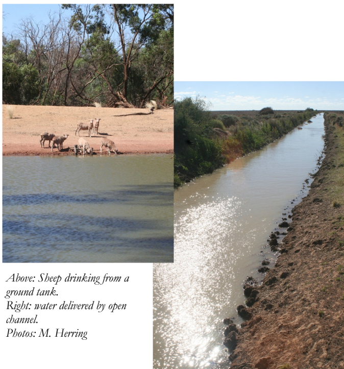
Above: Sheep drinking from a ground tank. Right: water delivered by open channel.

More information about the scheme can be obtained from Murrumbidgee Irrigation Ltd. http://www.mirrigation.com.au/