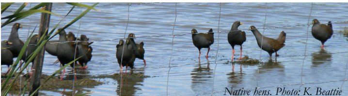
Native hens.