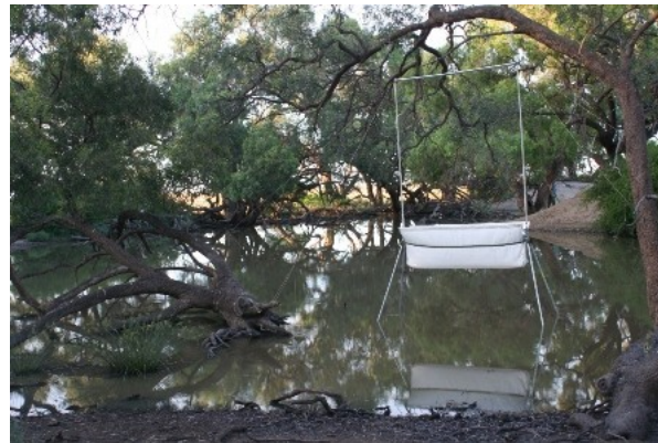
A harp trap for surveying bats in a tank near Hay.

The goal of this project is to demonstrate a number of options available to local landholders to mitigate the impact on native wildlife of the new Wah Wah Stock & Domestic Pipeline.