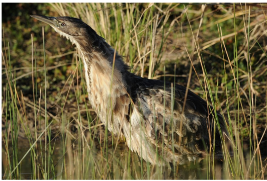
Left: The Australasian Bittern is a threatened species that relies on inland Wetlands - including well vegetated farm tanks - for survival. Photo: